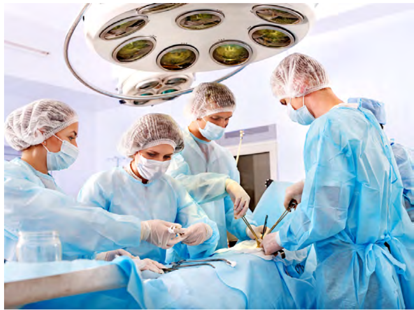
Operating Theatre Environments requiring vital protection and early indication