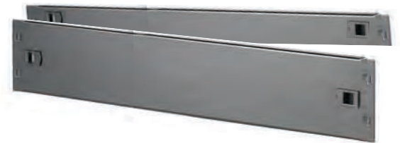
Toolless Installation no fixings required

Horizontal Cable Management - 2 RU (Metal SPCC) No Fixing Required - Simply Clip-Into Place