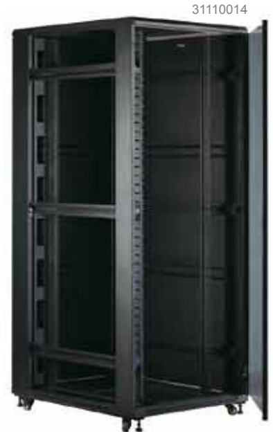
37RU (800 W) Front/Side View