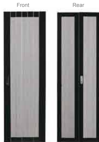
Perforated Vented Steel - Front Door (Curved) Perforated Vented Steel Dual Split - Rear Doors (Fitted as Standard)

2 Fan Cooling Kit - 600 D 4 Fan Cooling Kit - 800 D (Roof Mounted)